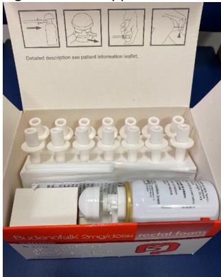
Fig 1 – Box as supplied